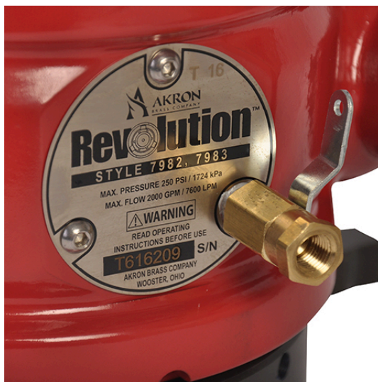
Drain valve for Revolution firefighting intake valve