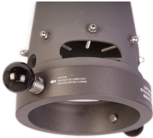
737 shown with 5177 nozzle