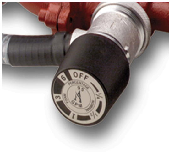
Foam Eductor Metering Head