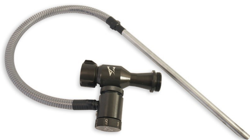
Portable In-Line Foam Educator