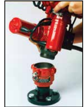
2" Quick-Disconnect, Ideal for Rapid Change Out