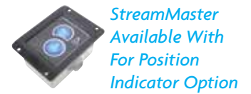
StreamMaster Available With For Position Indicator Option