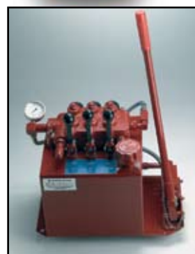
Style 3590 Genesis Manual HPU