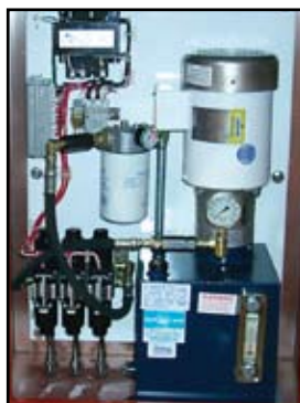
Style 3595 Genesis Electric HPU