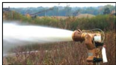
Style 3476 Brass Genesis Monitor